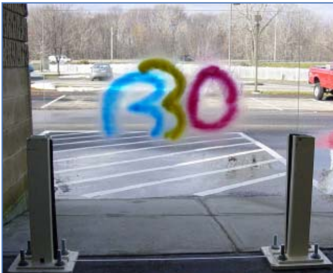
1. Start of Test

Below are pictures of PARAGLAS SOUNDSTOP sheet that were defaced or “tagged” with a solvent-based acrylic modified resin spray paint and then cleaned with Disappear™ graffiti remover. For this test, the remover was sprayed on the graffiti and allowed to soak for 15 minutes. Then it was removed with a 2300-psi pressure wash. The paint was allowed to dry for 25 days prior to removal under this procedure.