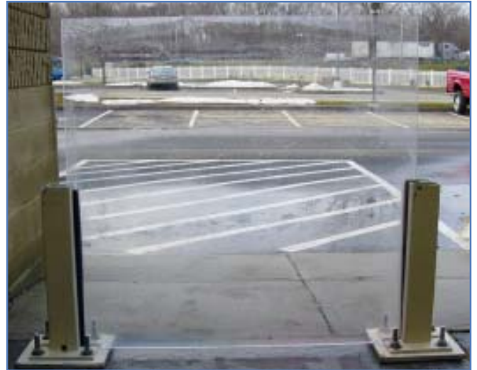
4. After Water Rinse with 2300-psi Pressure-Wash