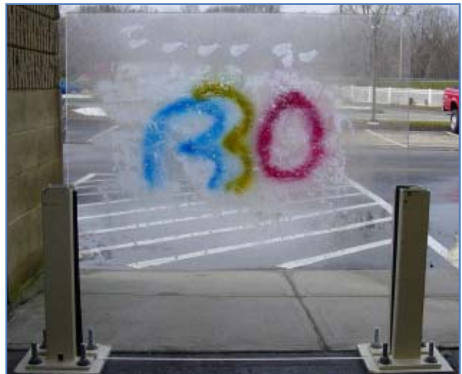
2. 10 Minutes after Remover is Applied