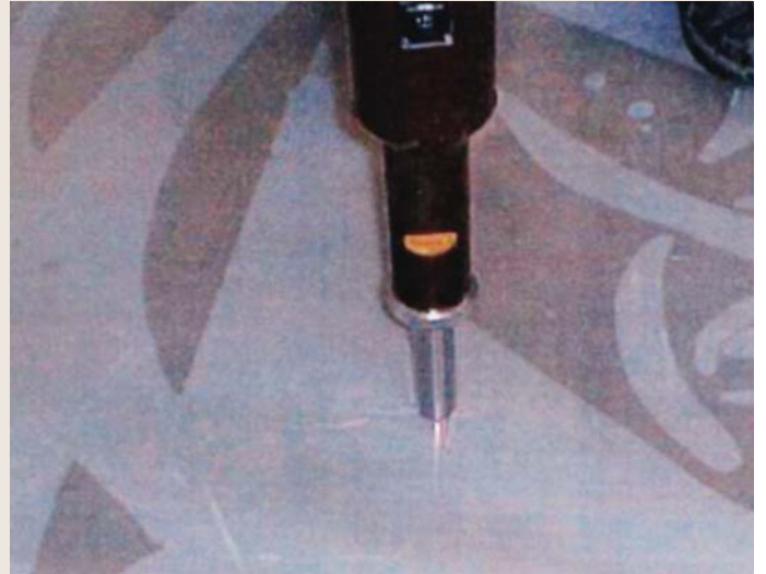
Point 2 – Center Impact with Concrete Testing Hammer