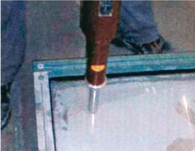
Point 1 – Edge Impact with Concrete Testing Hammer